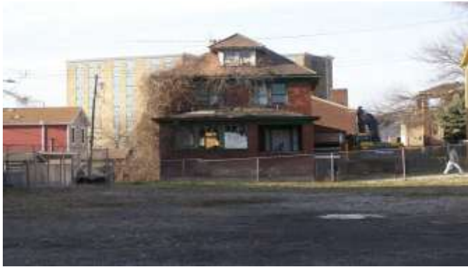
Vacant home set for demolition on Walnut St. (712 Baldrige Avenue – Rear)

North Braddock is always working to address the epidemic of abandoned buildings in the community. The borough receives allotted funding from CDBG grants for building demolition. Emergency demolition funding is also sought through Allegheny County to bring down unsafe structures. Tearing down vacant homes is very costly to hire contractors. North Braddock has nearly 400 buildings that need to come down to rebuild the community and improve public safety. Federal & state funding needs to be increased to help struggling towns. If you know of buildings that aren't secure, you should notify the borough of the addresses to prevent people from entering the unsafe structures.